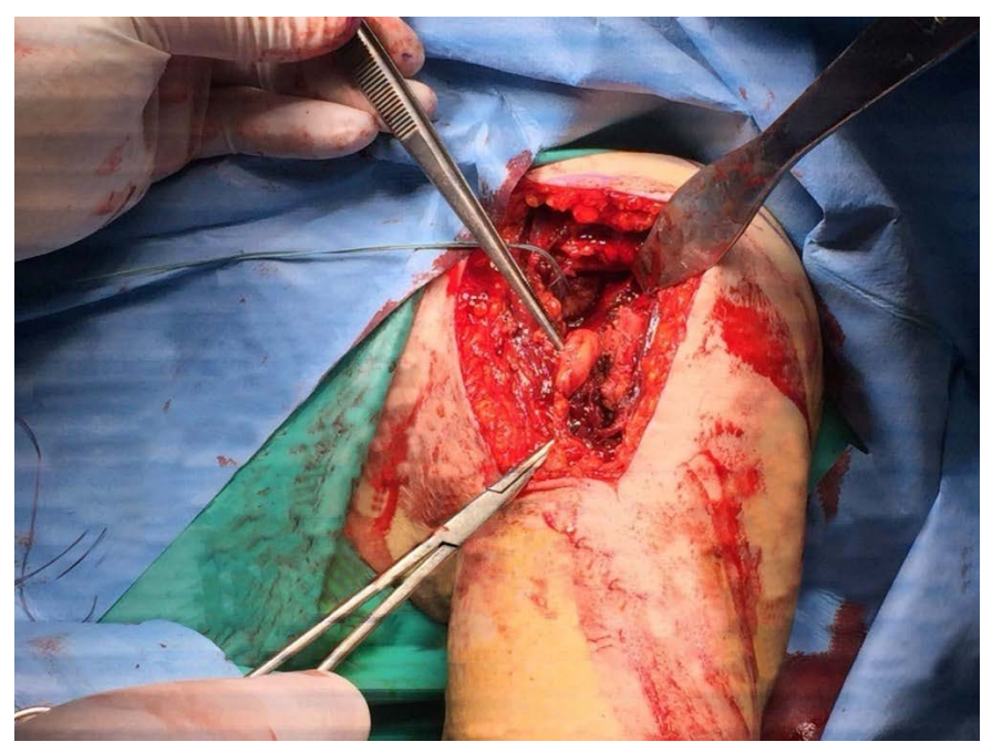
Fig. 2 –Intraoperatively, a 2.5 \times 1.5 \times 1 cm sized lymph node with an irregular surface and off-white color was observed near the left cephalic vein.